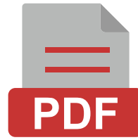
Leverage the power of Fillable PDF Forms