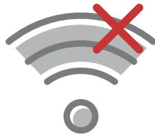
Offline Data Entry